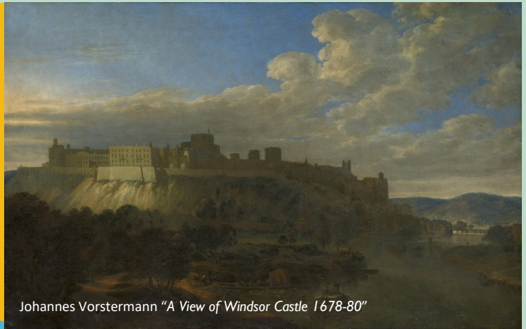
Johannes Vorstermann "A View of Windsor Castle 1678-80"

In the English Civil War Windsor Castle was in the frontline of a contest of arms between England's King and its Parliament.