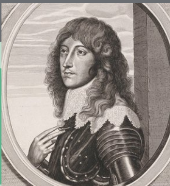
The Most Illustrious and High born Prince Rupert Prince Elector Palatine of the Rhine”.