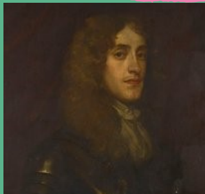
Peter Lelys (1663-5) "James II when Duke of York" RCIN407810

In 1674 it was revealed that Charles' brother and the heir presumptive James, Duke of York was a Roman Catholic. The King distressed by politics in London chose to reside further outside the capital at Hampton Court and Windsor. He also greatly admired the French architecture of Louis XV's Palaces so ordered the restoration of Windsor castle. Hugh May was chosen as an architect who began to restore the castle in baroque style, extending the North Terrace including a new building called "The building of the Star"