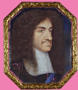
Samuel Cooper 1667 "Charles II" RCIN 420643

In 1668 Prince Rupert was made Constable of the Castle and began repairing the damage done to the property by the Parliamentary soldiers and succeeding squatters. The Round Tower became his lavish Headquarters filled with his armour collection and even had an alchemy laboratory.