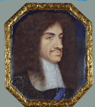
Samuel Cooper 1667 "Charles II"

England was governed by the Commonwealth from 1653-1659. the son of Charles I, (the future Charles II), was invited back from exile. This is known as "The Restoration." However, the terms of his return reduced his power from that held by Charles I, and so he expressed his kingship through image, ceremony and patronage of the arts. He remodelled Windsor Castle as a modern palace. Such actions helped reinforce his image as a divinely chosen King.