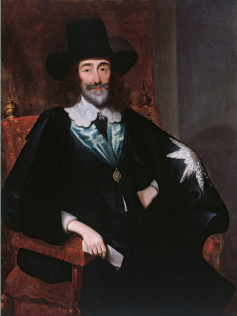
Edward Bower (1648) "Charles I at his trial." RCIN 405913 Kept at St James' Palace.

After his defeat by Parliamentary forces Charles I surrendered to the Covenanters. He then secured their allegiance and made another attempt to regain authority. Parliament defeated him again at the battle of Worcester in 1650 and the King was captured. His son and heir Charles fled into exile.