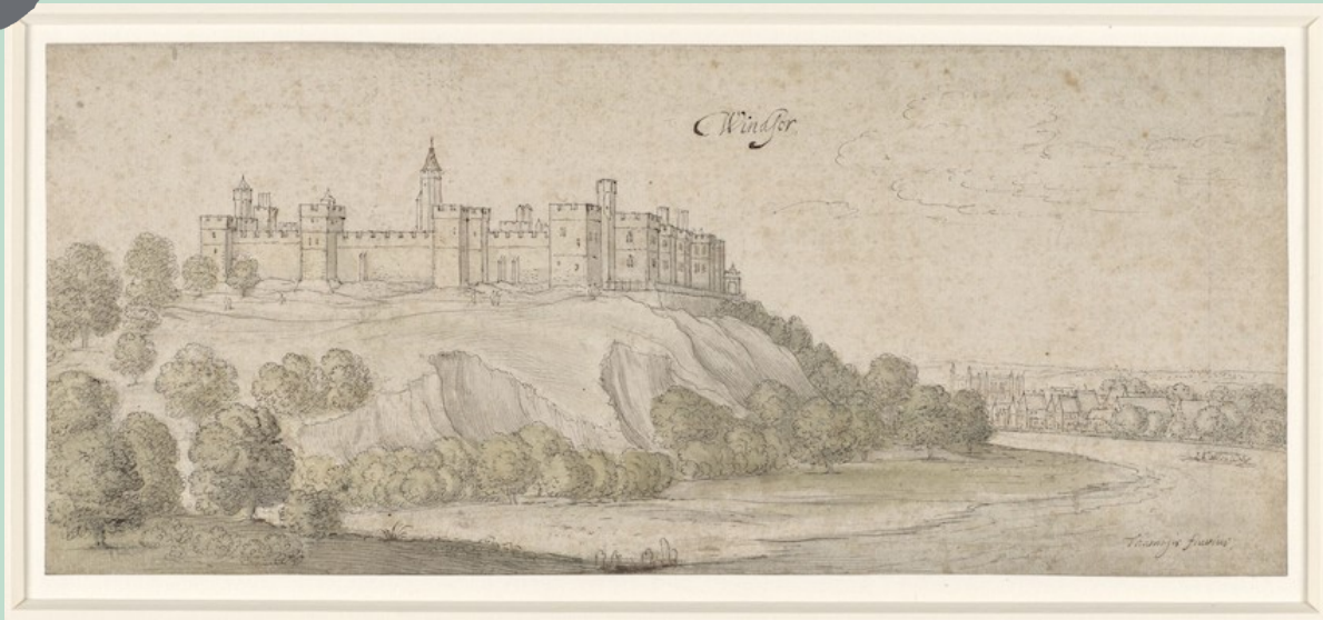
Wenceslaus Hollar (1638) “Windsor Castle from the North East”

On 10th February 1642 Charles I left Windsor Castle. He went to Nottingham and raised his standard against Parliament. At the battle of Edgehill the battle was inconclusive but, by abandoning London and Windsor, he lost a strategic foothold over the most important arsenals and garrisons. With Windsor empty, a force of Parliamentary London trained bands was able to secure the Castle, which became an arsenal against the King.