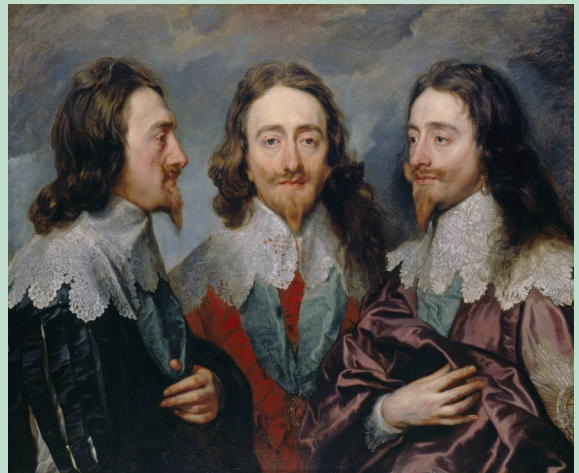
Anthony Van Dyke (1635) “Charles I” RCIN 404420. Oil on canvas.

On 10th February 1642 Charles I left Windsor Castle. He went to Nottingham and raised his standard against Parliament. At the battle of Edgehill the battle was inconclusive but, by abandoning London and Windsor, he lost a strategic foothold over the most important arsenals and garrisons. With Windsor empty, a force of Parliamentary London trained bands was able to secure the Castle, which became an arsenal against the King.