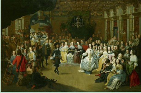
Hieronymus Janssons 1660 "Charles II dancing at a ball in Court" RCIN400525

After the Execution of Charles I England was declared a Republic, the Monarchy and the House of Lords abolished.