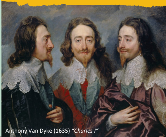
Anthony Van Dyke (1635) "Charles I"

King Charles I believed he was divinely ordained but his attempts to express power through military and religious changes were frustrated by Parliament.