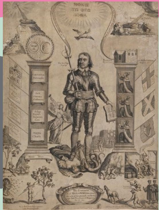
William Fairthorne (1658) "Oliver Cromwell between two pillars" rcin60228

During this time Windsor Castle remained a garrison and a prison for Royalist sympathisers and political prisoners.