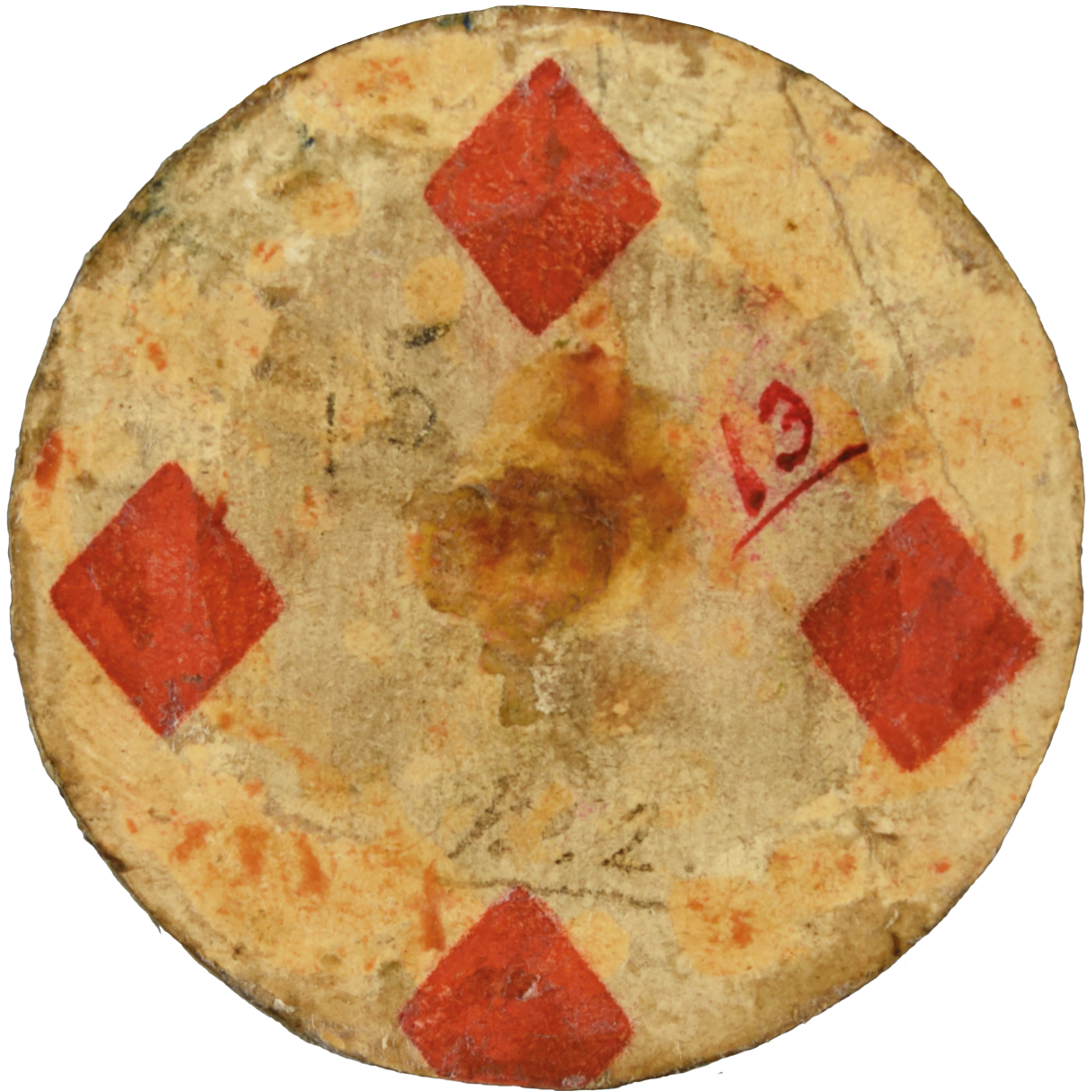
Back of miniature, mounted on a playing card, perhaps published by Valery Faucil.