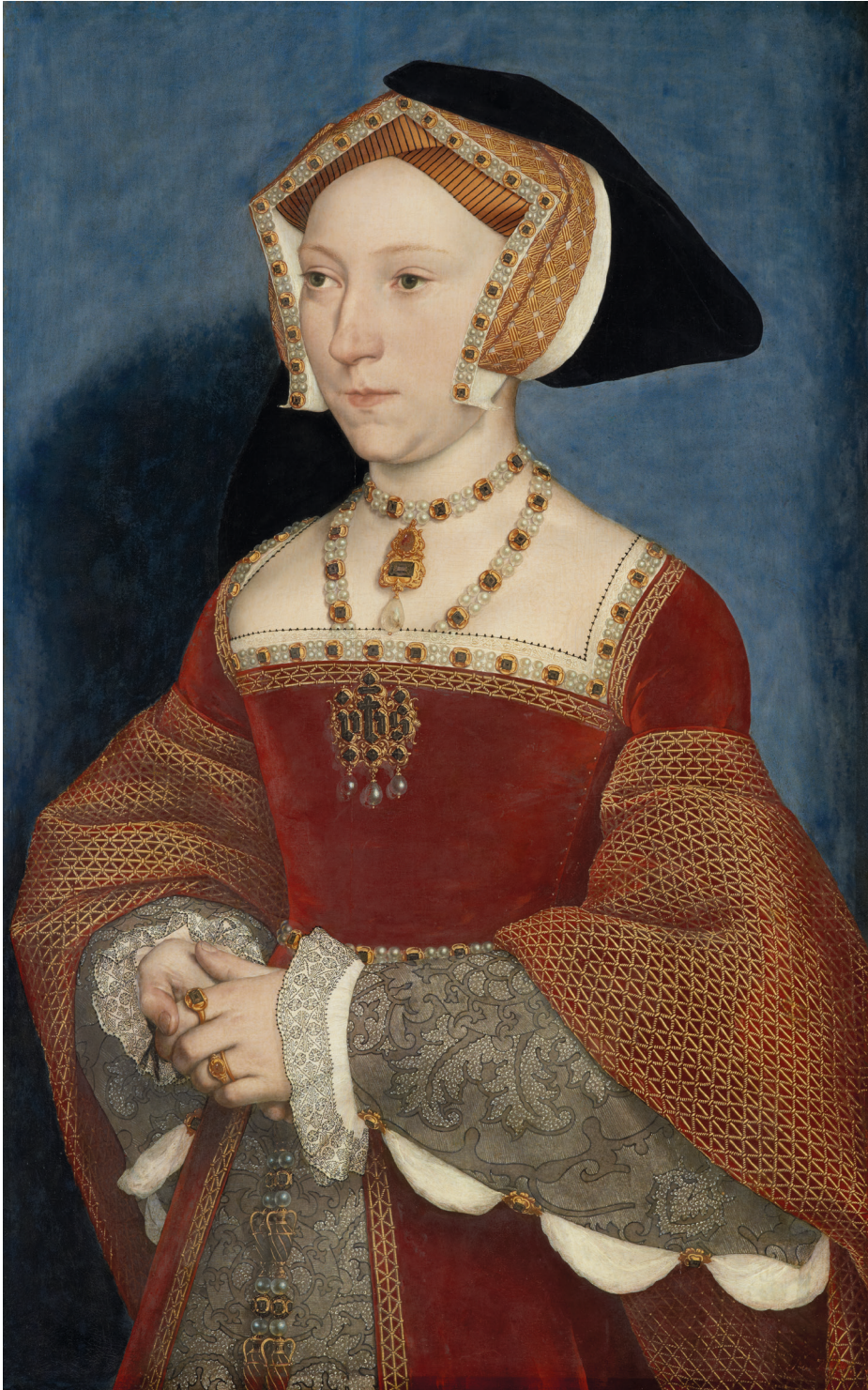
Hans Holbein, Jane Seymour, c. 1536–7, oil on panel